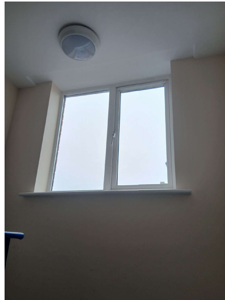
Windows (Communal Windows)