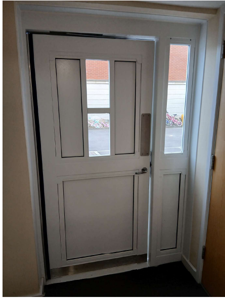
Entrances (Main Doors)