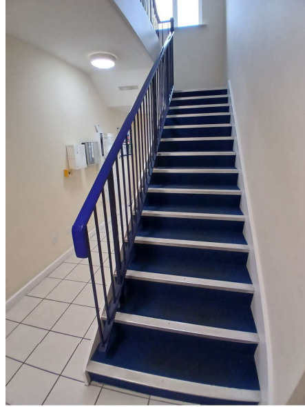
Hallway (Communal Lobbies and Stairs)