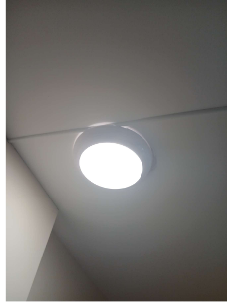
Lighting (Standard and Emergency Lights)