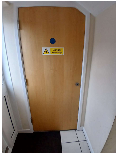
Cupboard Doors (Electrical Cupboard Doors)